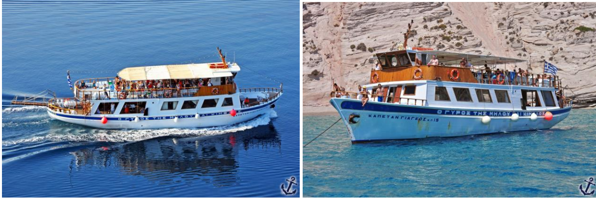
Figure 1: Boat that will be employed for the tour, named “Captain Yagos”.

The boat is stably built and resistant to moderate waiving thus limiting the possibility of sea sickness. However, some rotational boat movement, i.e. pitch and roll, will be anticipated particularly for winds 4-6 Beaufort scale. Normally, during the period of the planned boat tour the winds are blowing to low intensities, e.g., up to 3 Beaufort scale, thus minimal rotational movement is anticipated.