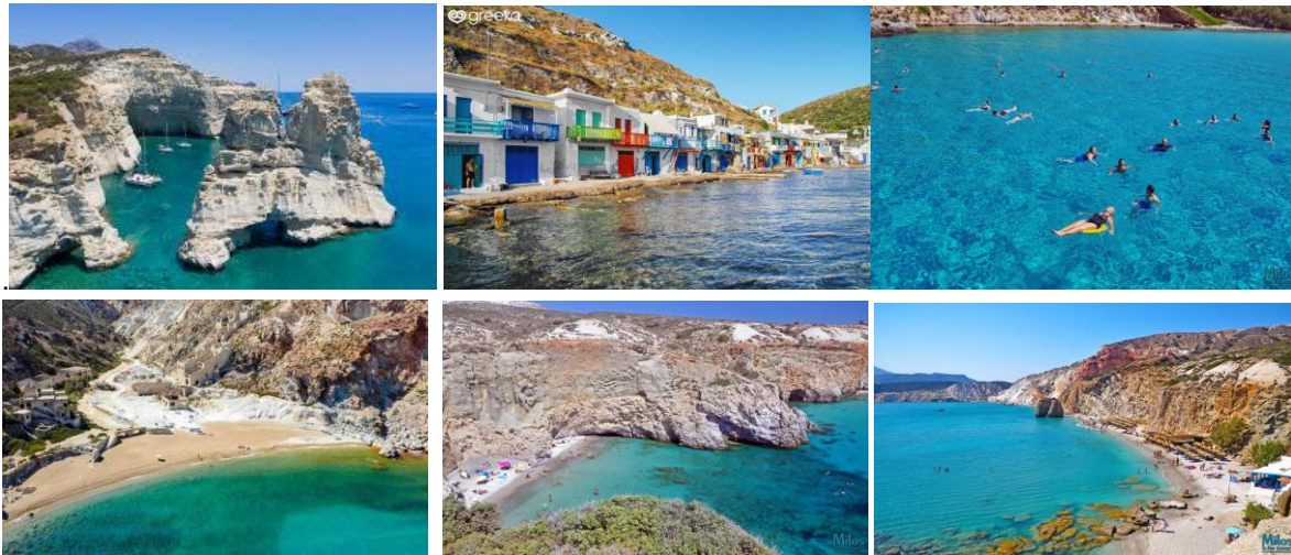
Figure 3: Few places/landscapes out of those visited during the boat tour.

With the boat tour an amazing opportunity will be given to participants to witness the most mesmerising landscapes, seas and coastlines in Greece in a truly unique experience. Examples of spots to be sailing to are shown in Figure 3.